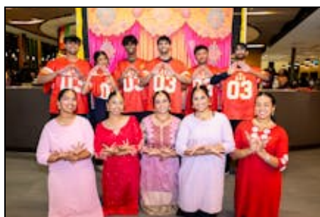
0b4952f8-42c9-... 1.2 MiB

Log in to nacufs.awardsplatform.com to see complete entry attachments.