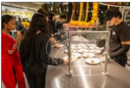
DSCF0302.jpg 872 KiB