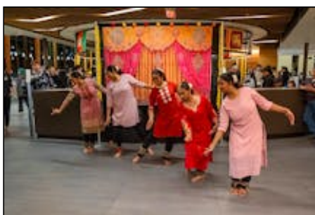
52e2713c-f79a-... 1.2 MiB