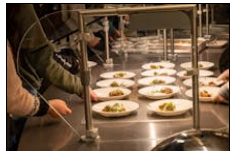
DSCF0309.jpg 654 KiB