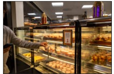
DSCF0239.jpg 562 KiB