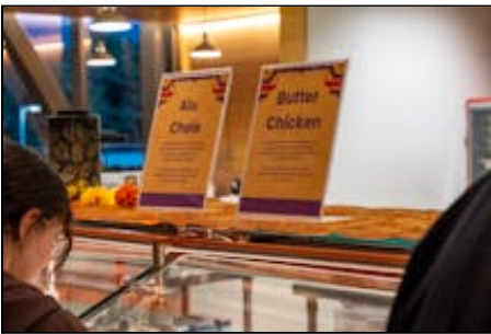
DSCF0225.jpg 816 KiB