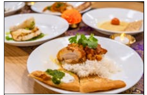
f7107ccc-a0cb-... 758 KiB