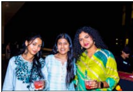
e29ad529-83fa-... 864 KiB