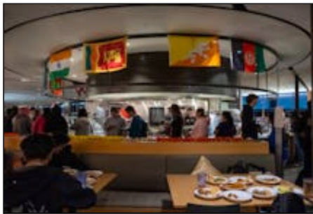
DSCF0235.jpg 941 KiB