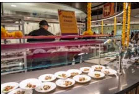
DSCF0243.jpg 963 KiB