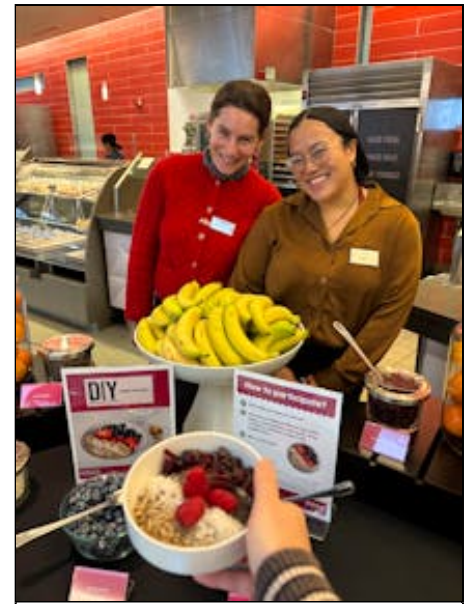
DIY Oatmeal.jpg 4.2 MiB