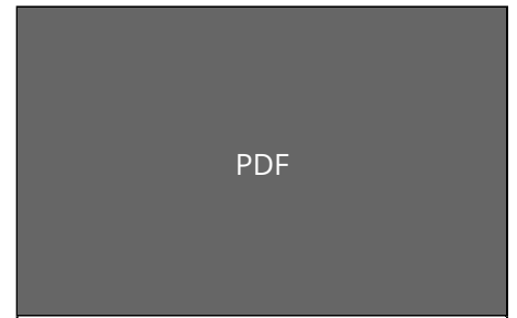
(8.5x11) Dietitia... 1.5 MiB