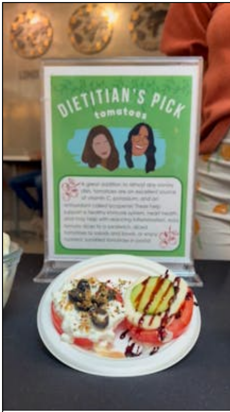
DP Tomato 1.jp... 1.3 MiB