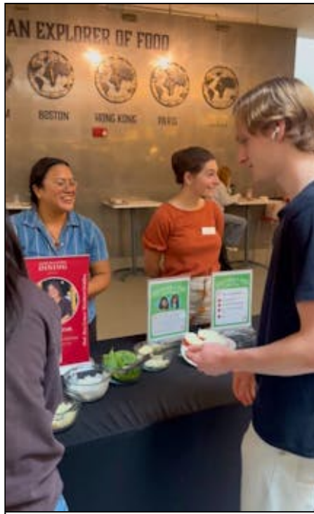
DP Tomato 4.jp... 1.5 MiB