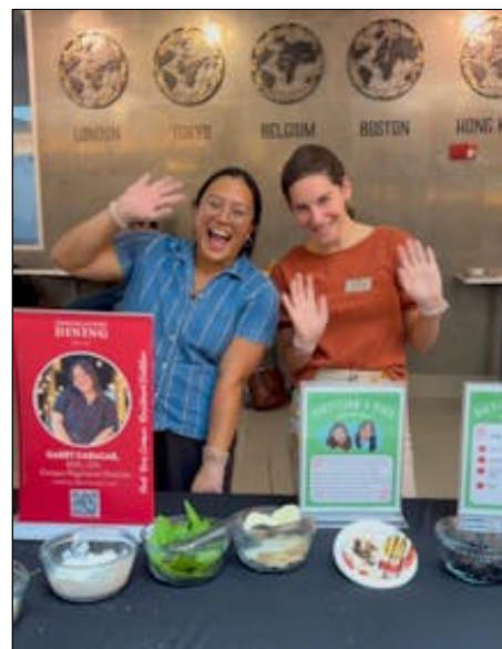
DP Tomato 2.jp... 1.4 MiB