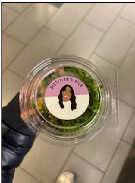
IMG_6227.jpg 3.6 MiB