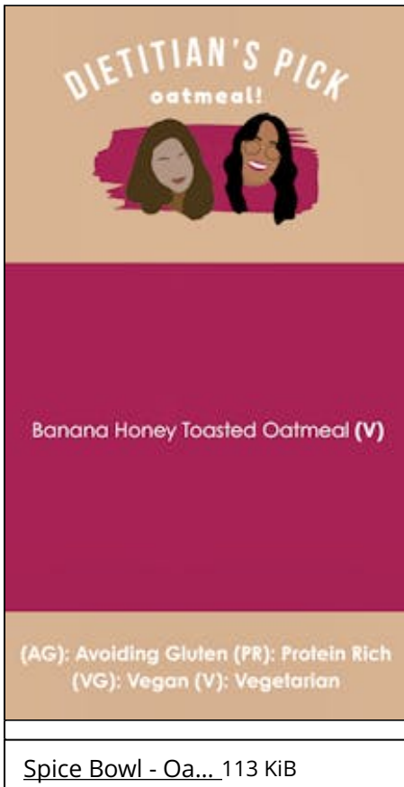
Spice Bowl - Oa... 113 KiB