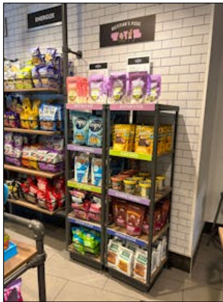
Dietitian's Pick ... 4.3 MiB