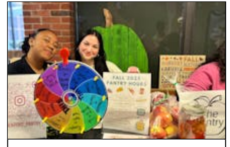
student_partne... 883 KiB