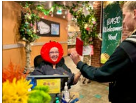
one_core_trees... 1.9 MiB