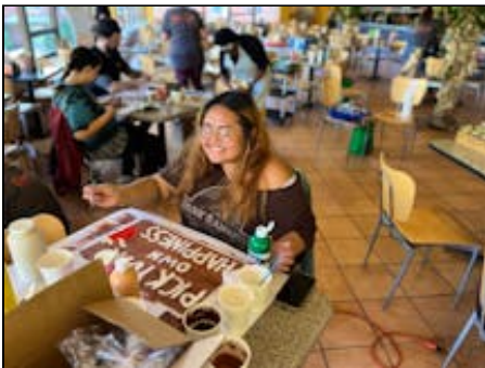
student_craft_p... 2.0 MiB