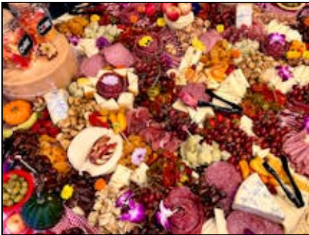
charcuterie_dis... 4.1 MiB