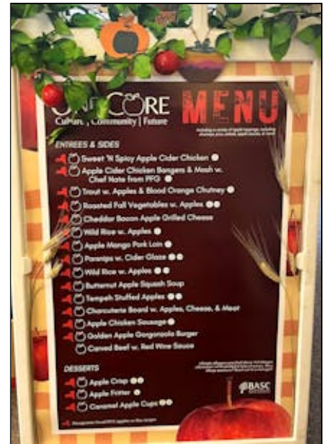
One core men... 1.4 MiB