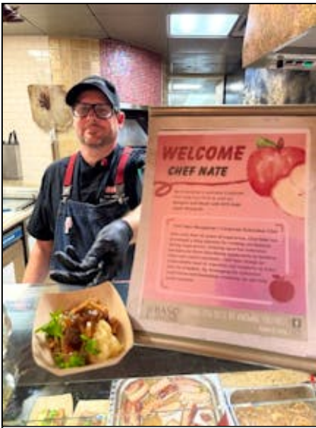
pfg_guestchef_... 100 KiB