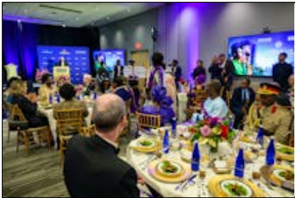
446_0250-LoRes.... 1.4 MiB