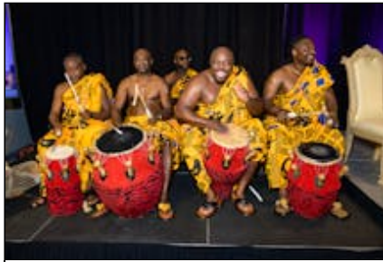
446_0222-LoRes.... 1.3 MiB