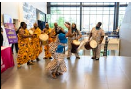
446_0164-LoRes.... 1.3 MiB