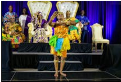
446_0295-LoRes.... 1.3 MiB