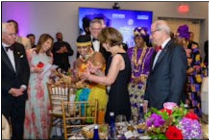
446_0226-LoRes.... 1.3 MiB