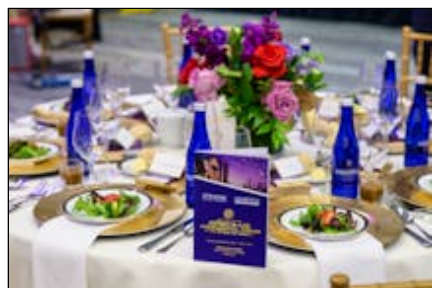
446_0047-LoRes.... 913 KiB

Log in to nacufs.awardsplatform.com to see complete entry attachments.