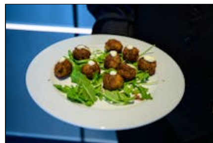
446_0061-LoRes.... 671 KiB