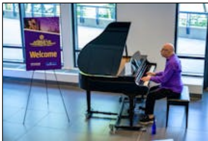
446_0064-LoRes.... 932 KiB