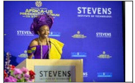
446_0237-LoRes.... 987 KiB