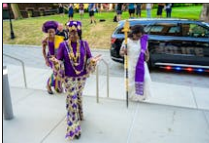
446_0173-LoRes.... 1.2 MiB