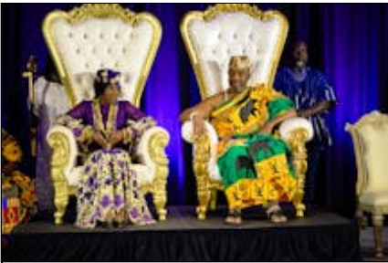
446_0275-LoRes.... 1.3 MiB