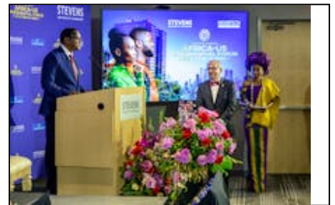
446_0313-LoRes.... 1.2 MiB