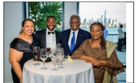
446_0157-LoRes.... 1.0 MiB