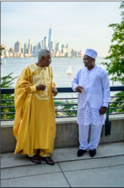
446_0142-LoRes.... 884 KiB