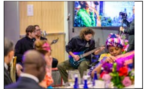
446_0304-LoRes.... 1.1 MiB