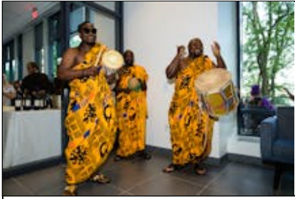
446_0152-LoRes.... 1.3 MiB