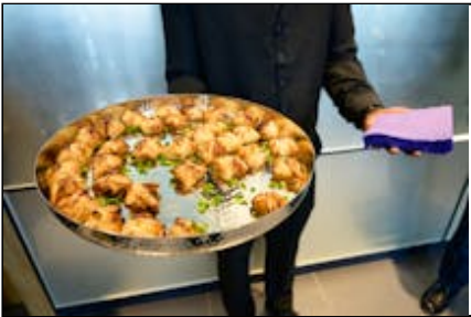
446_0062-LoRes.... 974 KiB