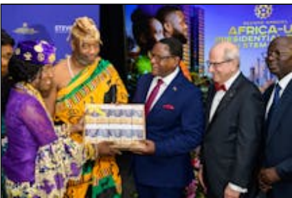
446_0500-LoRes.... 1.2 MiB