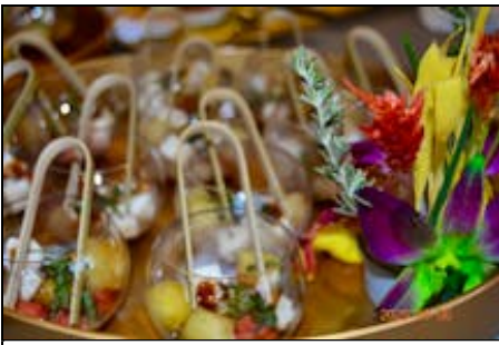
3EA064EF-BDB... 176 KiB