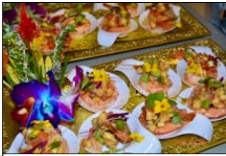
338D0BBE-6EA... 254 KiB