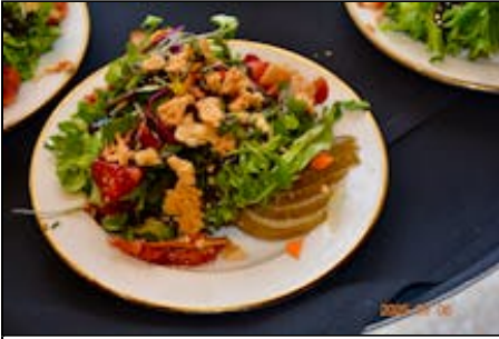
6474FAEE-FD8A... 220 KiB