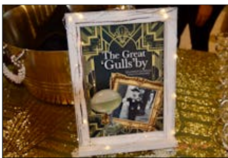
BD4C15B7-4D5... 291 KiB