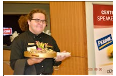
DABBB6F2-9CA... 170 KiB