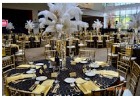
955709F4-D85D... 313 KiB

Log in to nacufs.awardsplatform.com to see complete entry attachments.