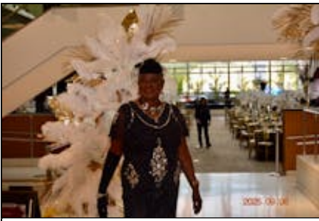
235FE1E2-6DD... 223 KiB