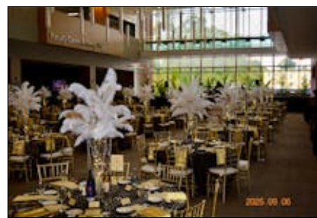
D4A81ACA-79F... 283 KiB