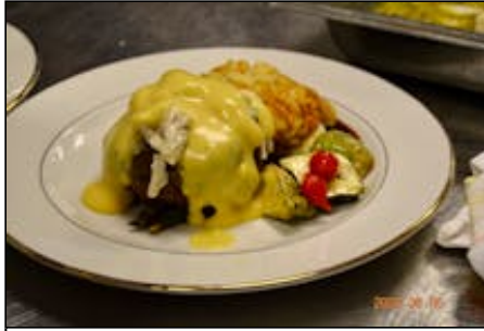
AC042C80-DCE... 139 KiB